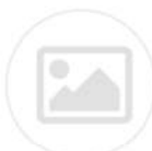
To be appointed Senior Technical Officer