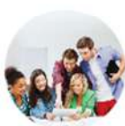
N-TUTORR Student Champions announced in June