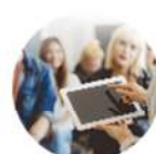
N-TUTORR Academic Champions