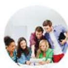
MRes Researcher announced in June

NOTE: 50+ staff (Champions & Fellows) across 9 campuses in place for N-TUTORR transformation LTA themes.