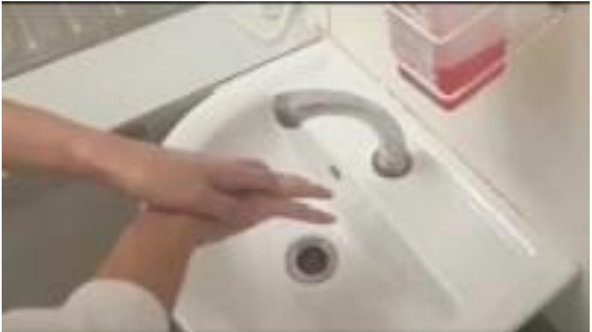
A Complete Guide To Clinical Hand washing - YouTube