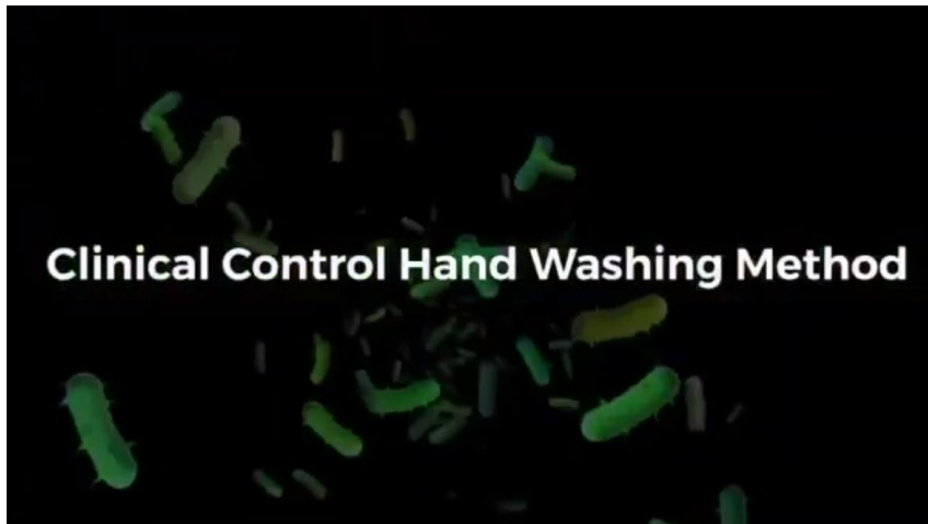
Clinical Infection Control - Alcohol Gel