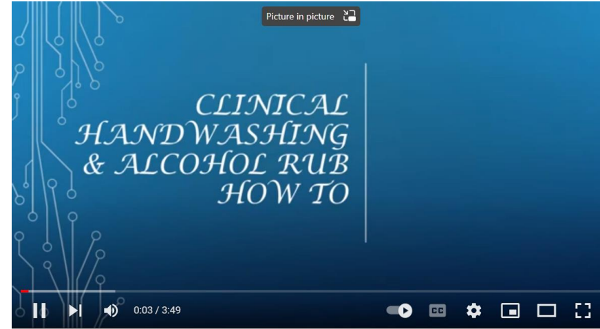
Clinical Handwashing and Alcohol Rub technique